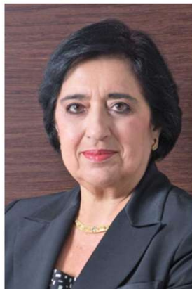
Her Excellency Dr Erato Kozakou-Marcoullis (ret'd)

Former President of the Supreme Court of Cyprus and Honorary Fellow, School of Law, UCLan Cyprus.